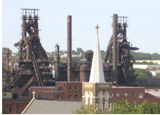
St. John's Windish Lutheran Church